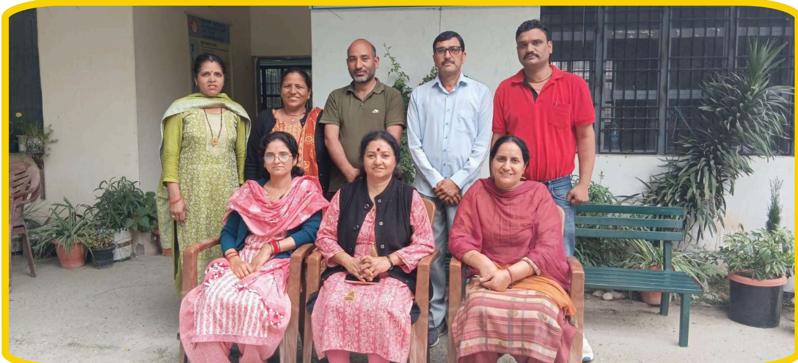
College Non-Teaching Staff