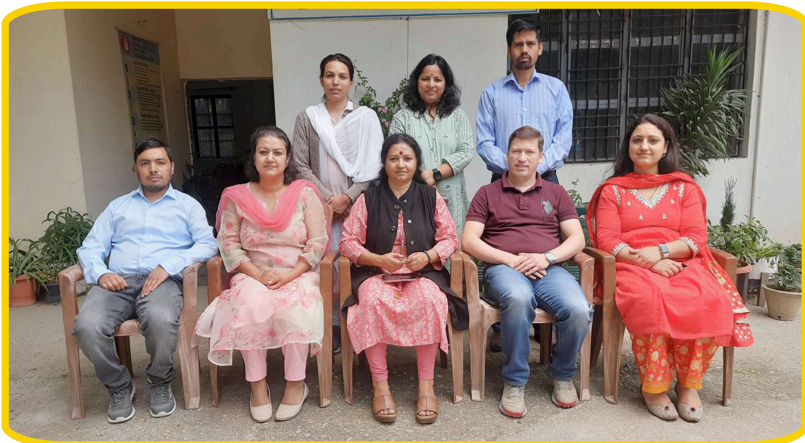
College Teaching Staff